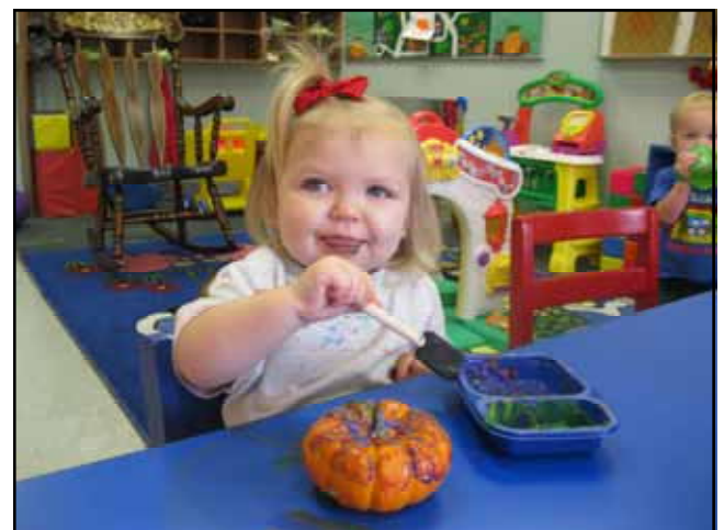
Bella had a ball painting her pumpkin