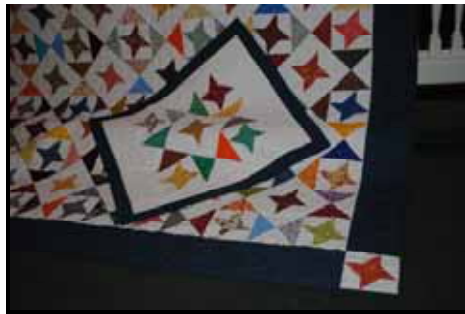
2011 Quilt—Stars in Time Presented by The Sew Blessed Quilters